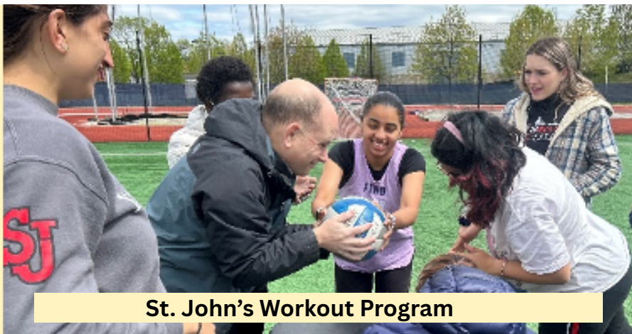
St. John's Workout Program