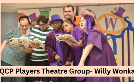
QCP Players Theatre Group- Willy Wonka