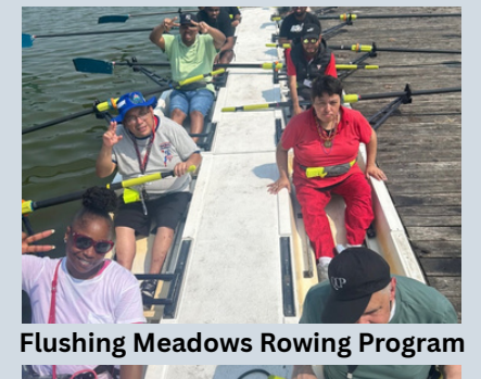
Flushing Meadows Rowing Program