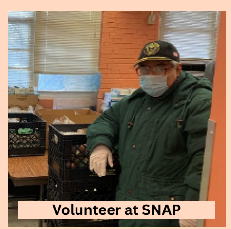
Volunteer at SNAP

QUEENS CENTERS FOR PROGRESS 81-15 164TH STREET, JAMAICA, NY 11432